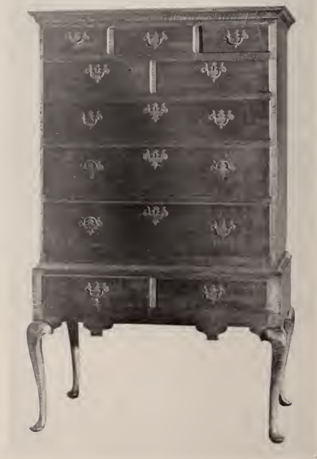
179—FIDDLEBACK MAPLE HIGHBOY American, XVIII Century

Kindly read the Conditions under which every item is offered and sold. They are printed in the forepart of the Catalogue.